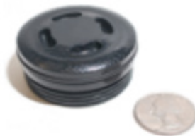
1.87" Diameter x 1.12" Depth